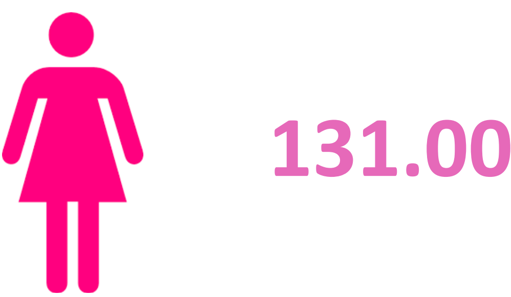
Incidence rate in female

Death rate in Missouri with Female Breast cancer per 100 thousand is 19.80